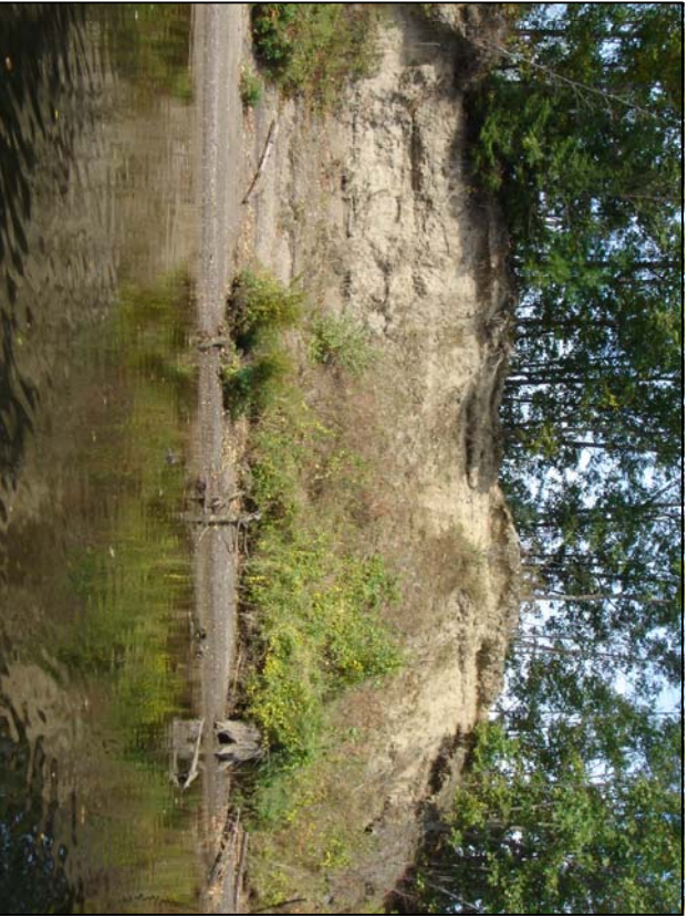
EXAMPLE OF EXISTING CONDITIONS OF ERODED RIVER BANK